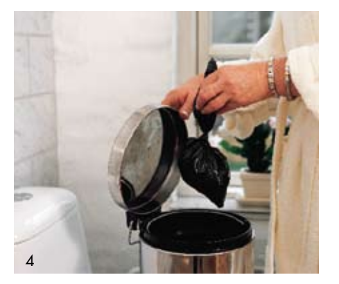
Place the used pouch and wafer into a small disposal bag, tying a knot before placing into a waste bin.