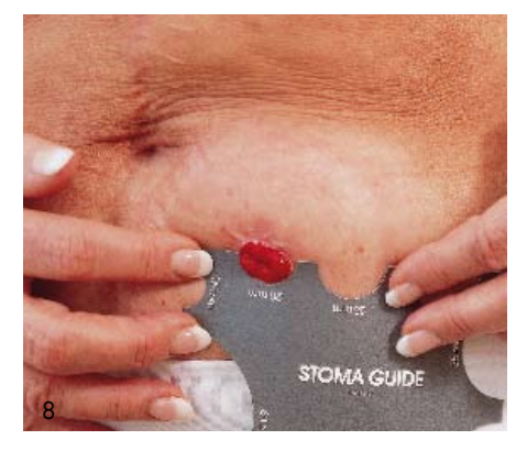
If needed use the stoma measuring guide to determine the size of the stoma.