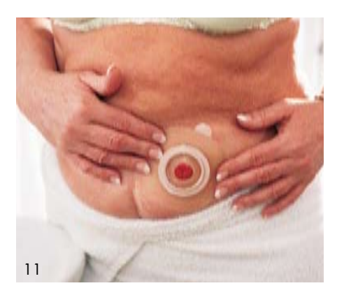
Centre the adhesive wafer opening over the stoma and press into place.