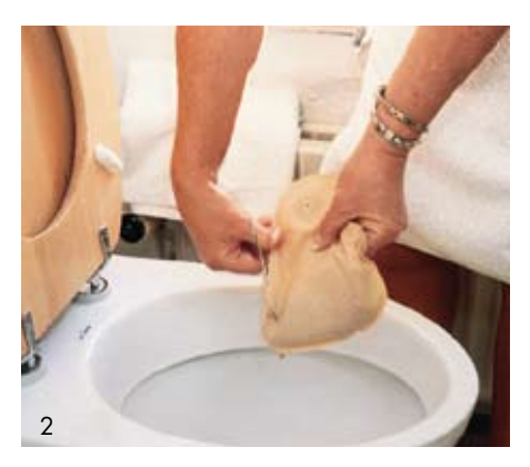
Empty the pouch contents by cutting open the bottom of the pouch, and flush the contents away.