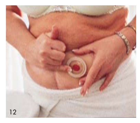
Press the wafer from centre to edge and continue around the stoma until you are certain the wafer fits snugly and securely.