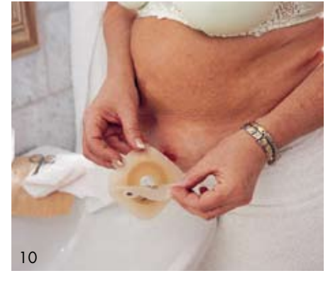
Remove the protective covering of the adhesive wafer immediately before application.

important that the hole fits your stoma snugly without applying any pressure.