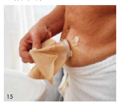
Double check that the pouch is securely connected to the wafer ring.