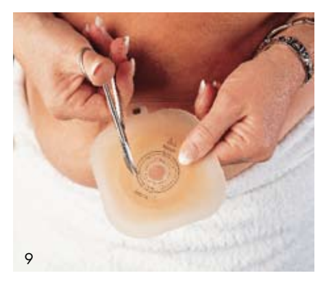
If your stoma is uneven or oval, adjust the hole in the wafer with small, sharp scissors or use the tip of your finger to even the hole to the correct stoma diameter. Remember: it is

important that the hole fits your stoma snugly without applying any pressure.