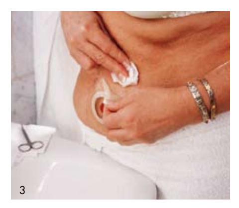
Tighten the skin on your abdomen by pressing it with one hand, while you carefully remove the adhesive wafer.